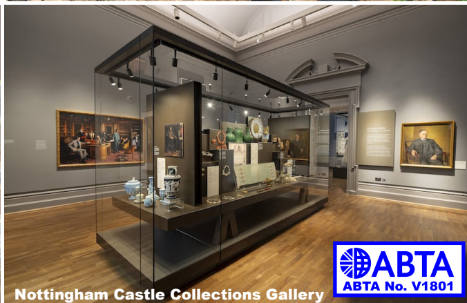
Nottingham Castle Collections Gallery