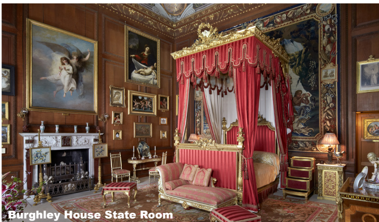
Burghley House State Room