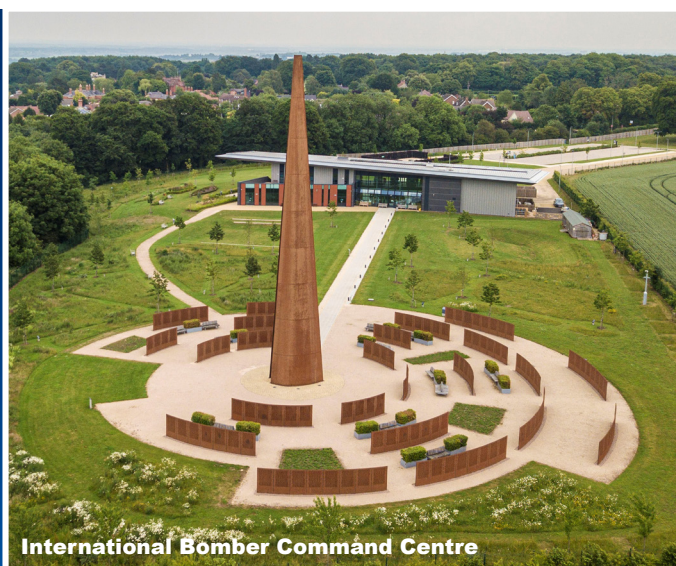
International Bomber Command Centre